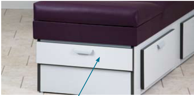
Built-in paper dispenser