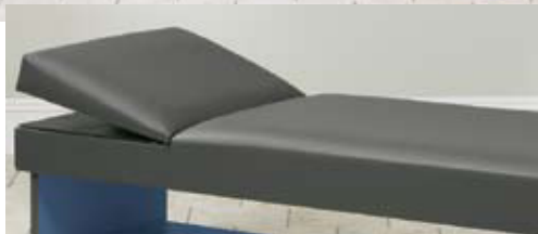
016 Optional Adjustable Wedge Headrest